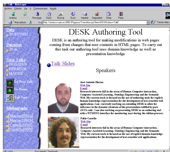
Figure 1. Web page generated for a knowledge unit of class Talk

PEGASUS can be seen as implementing a transformation over a domain model D and a presentation model P , that results in the creation of a web page. For a knowledge unit x \in D , PEGASUS generates a web document D_{HTML} . If we represent such transformation as a function f(D, P, x) \rightarrow D_{HTML} , DESK represents the inverse function f^{-1}_{D, P, x}(D_{HTML}, D'_{HTML}) \rightarrow D', P' , where D'_{HTML} represents the document modified by the user, and D' and P' are the domain and presentation models after being modified by DESK.